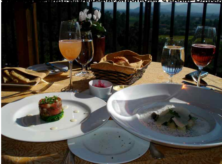
Sustainable Onions, Cauliflower, Brussels Sprouts, Potato, Basmati, Faraway Bagels, Baby Leeks