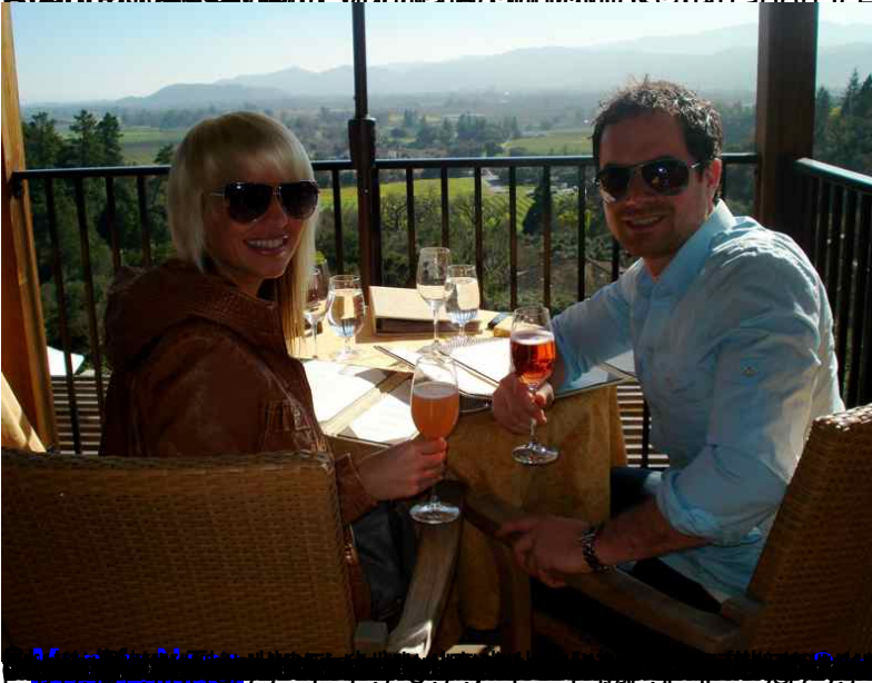
... Cream, Arbequina Olive Oil Fairy