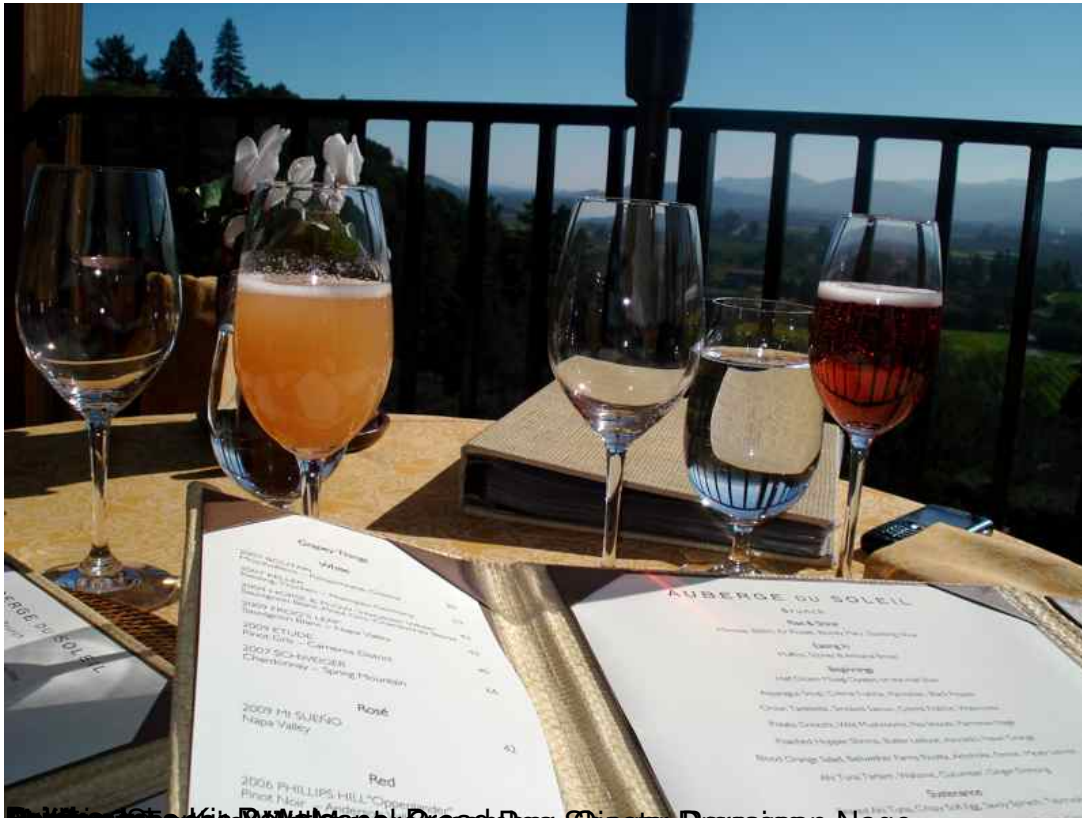
White, Green, Pinot Noir, Chardonnay, Riesling, Pinot Noir, Chardonnay, Pinot Noir

Wednesday, 09 March 2011 11:16 - Last Updated Friday, 22 April 2011 09:11