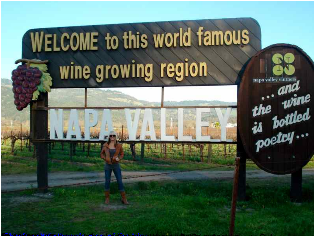
Chateau St Hill Winery, Napa Valley, California. Requires approximately

Wednesday, 09 March 2011 11:16 - Last Updated Friday, 22 April 2011 09:11